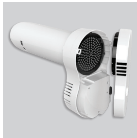
Maintenance and cleaning: Easy access.